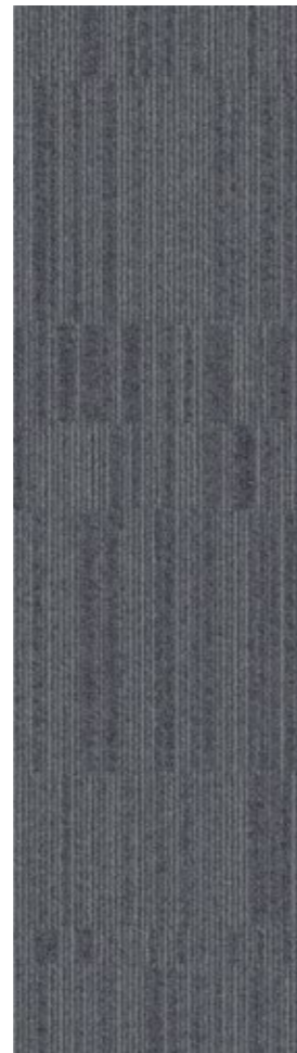
312897 North Sea