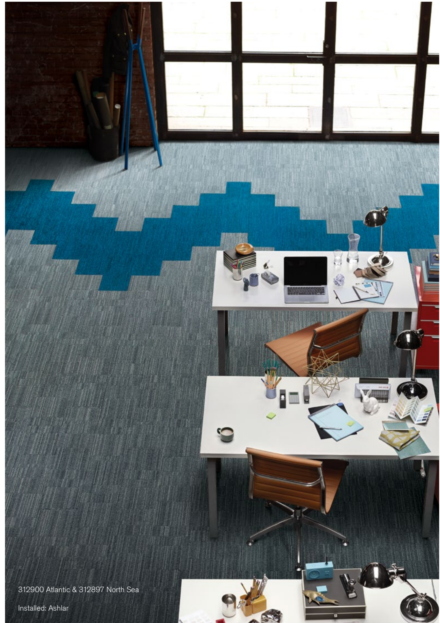
312900 Atlantic & 312897 North Sea