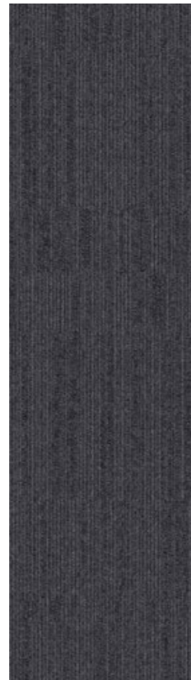
312896 Black Sea