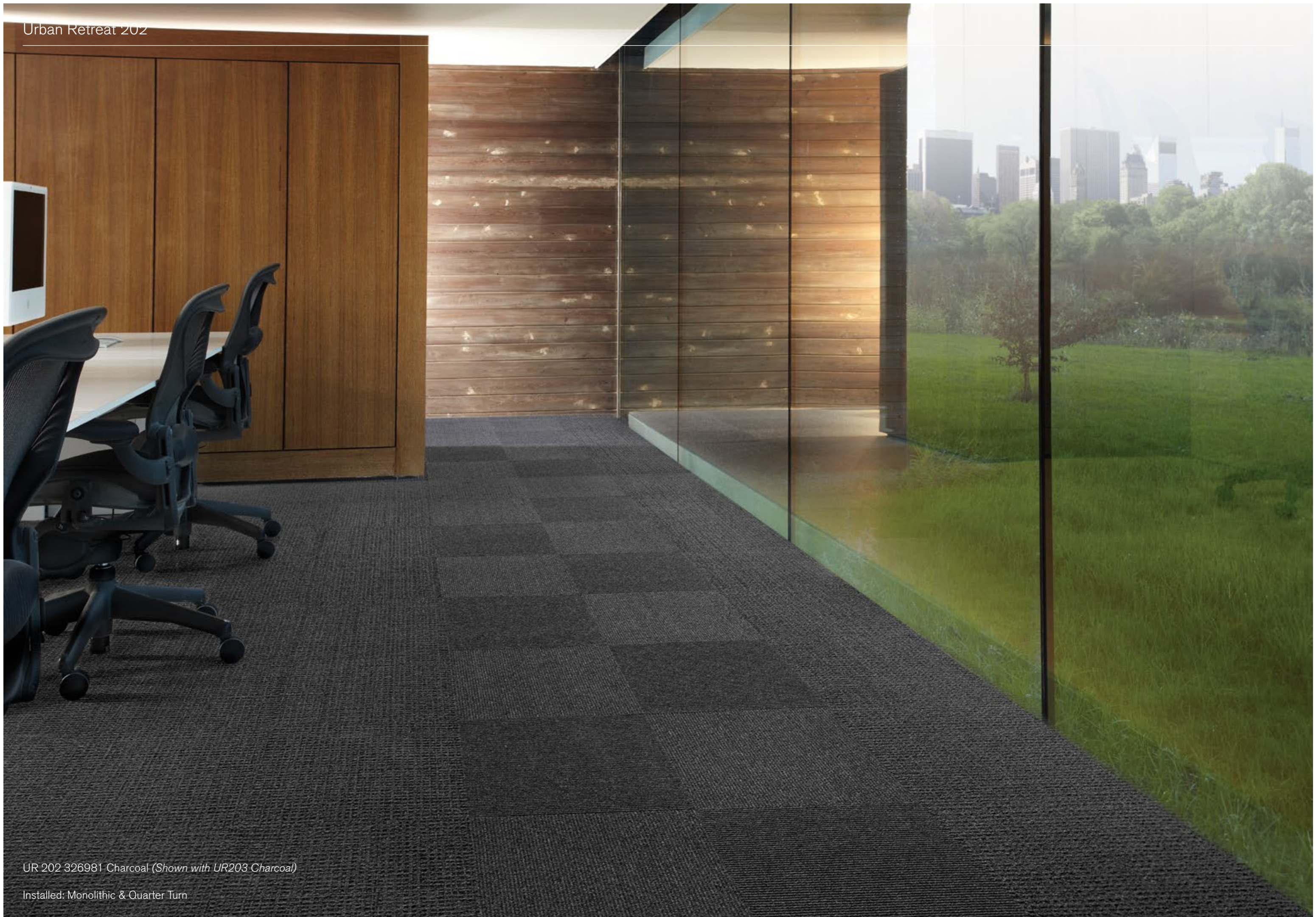
UR 202 326981 Charcoal (Shown with UR203 Charcoal)