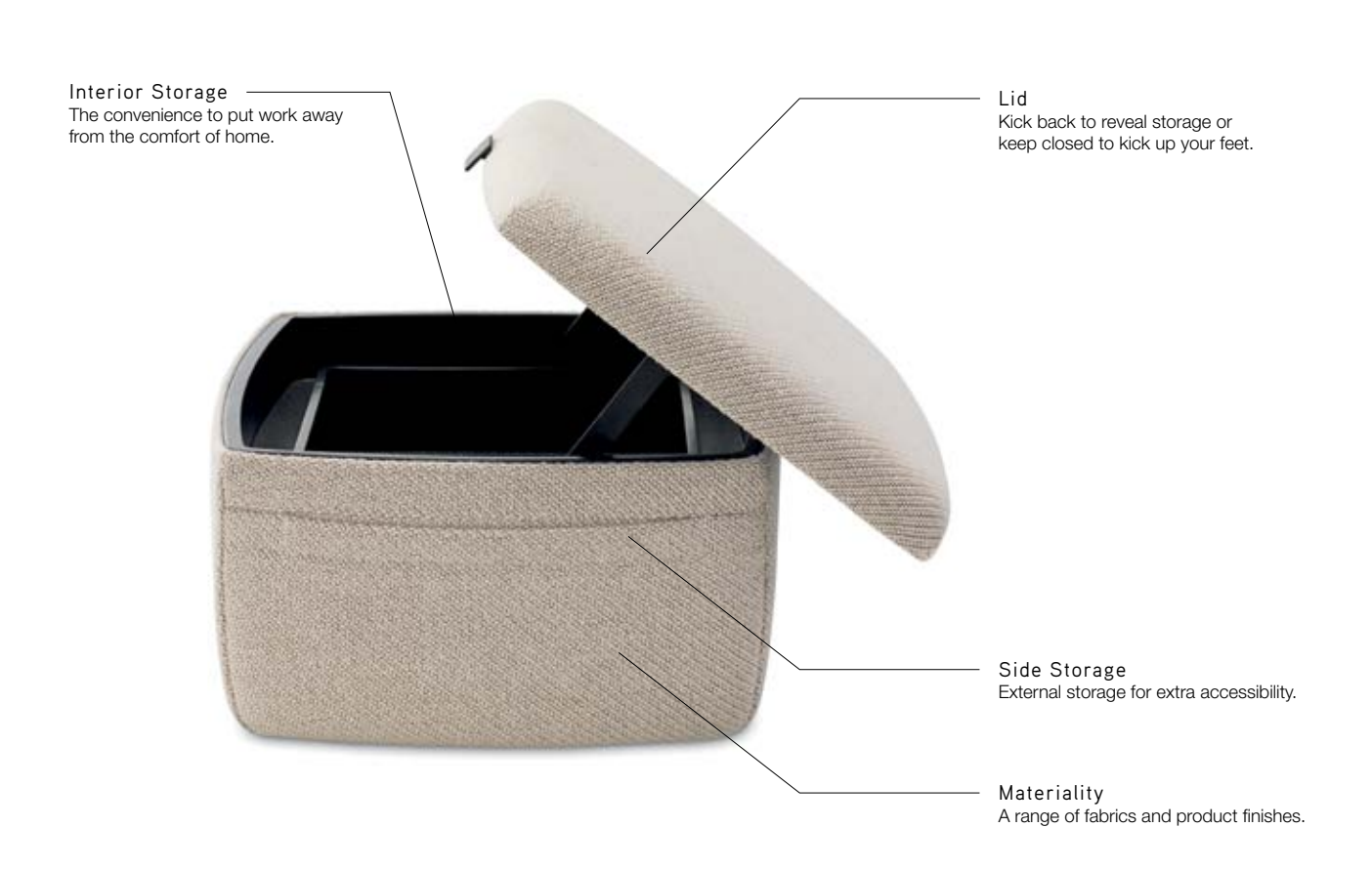
Massaud Work Lounge