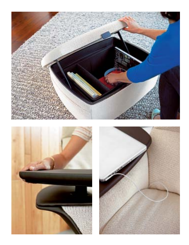
Comfort comes in all forms. From the physical to the emotional, the Massaud Work Lounge is designed for relaxed postures and the ultimate peace of mind. Work productively in the office or from the comfort of home, all without compromising residential appeal.

As mobile devices free people from the permanency of a single workspace, the desk is no longer the only hub for productivity. Mindful of comfort and posture, the Massaud Work Lounge is designed to serve technology and transient work needs.